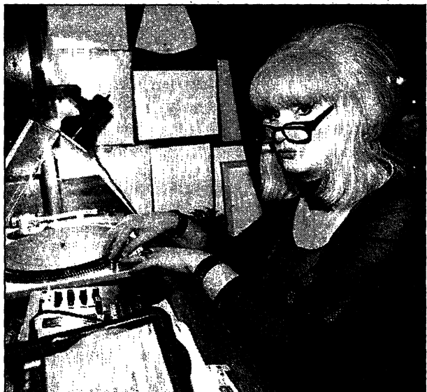
Legendary punk rocker Jayne County offers a Bowie cover of a Who tune or some early Clash at Manitoba's

"Now people are discovering how cool these records are. It's wild magic."